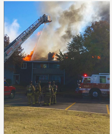
At the scene of the apartment fire.